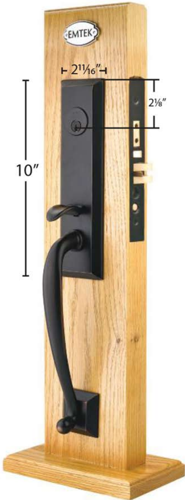
Harrison Trim Style Part # UL 3351