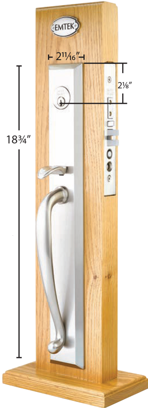
Middleton Trim Style Part # UL 3352