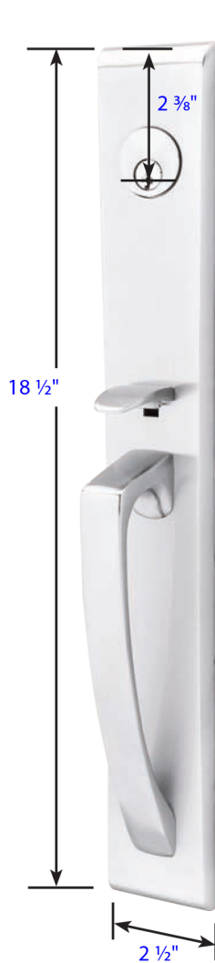
Orion Style Part # 4816